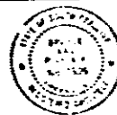
EXHIBIT B SHEET 3

MILLER/PLAYER & ASSOCIATES ARCHITECTS AND PLANNERS, LTD.